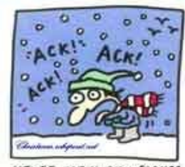
WEVER CATCH SNOWFLAKES WITH YOUR TONGUE UNTIL ALL THE BIRDS HAVE GONE SOUTH FOR THE WINTER.