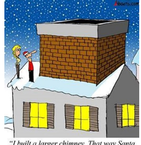
"I built a larger chimney. That way Santa wouldn't have a problem getting a boat down it."